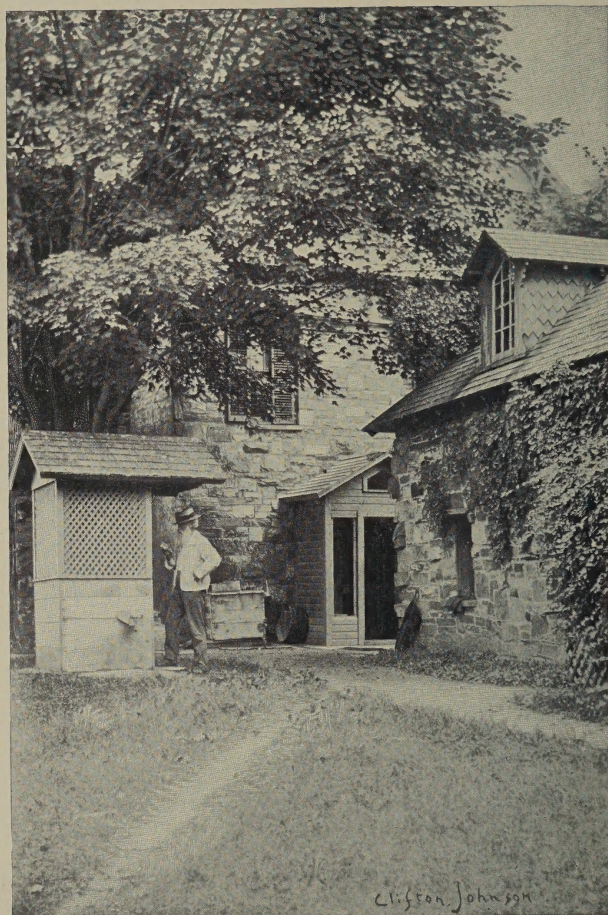
RIVERBY, MR. BURROUGHS'S HOME ON THE HUDSON